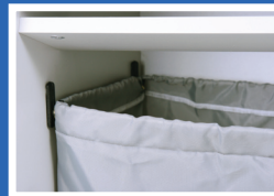
Nylon bag hooks makes bag fit tight. No paper misses the bag.