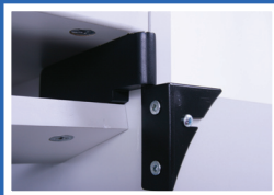
180 Degree nylon hinge for unobstructed collection